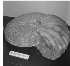
Ammonite Lowndes Co, MS