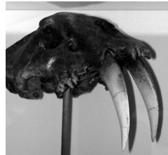
Smilodon skull cast Saber Toothed Cat