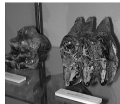
Mastodon molars Mississippi